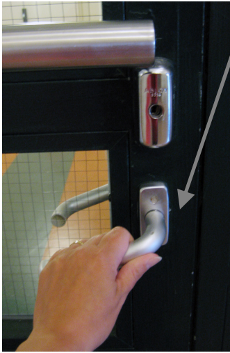
The electric key reader

The door is locked, if it does not open from the gray handle.