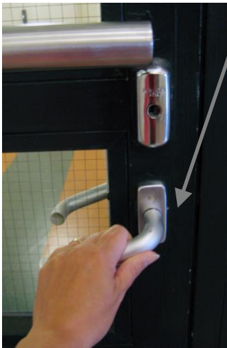
The electric key reader

The door is locked, if it does not open from the gray handle.